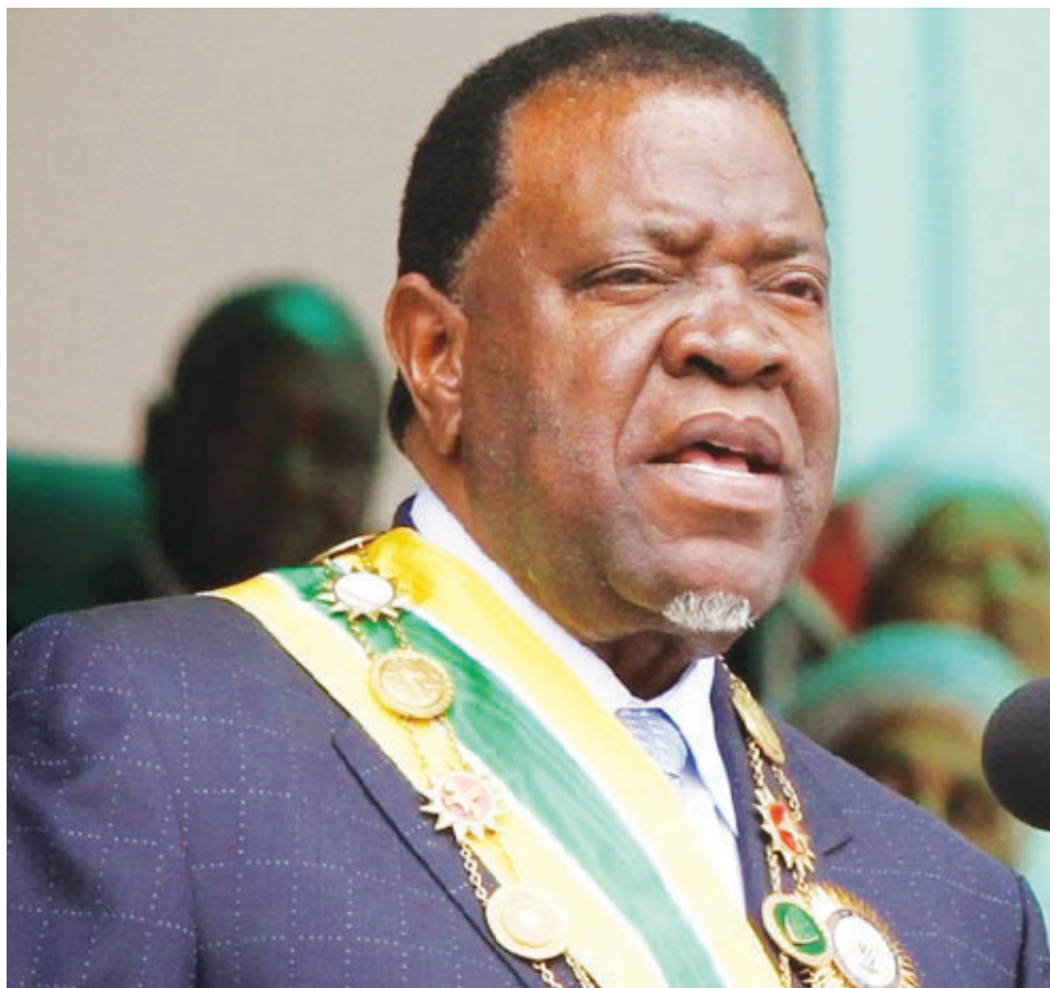
Namibian President Hage Gottfried Geingob

PREPARATIONS for the 58th edition of the Zimbabwe International Trade Fair (ZITF) are on course, running from April 25-29, at the Zimbabwe International Exhibition Centre in Bulawayo.