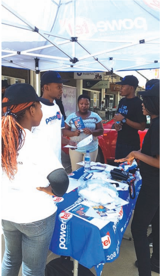
Market activations at OK Mart where Powertel team was activating customers onto their virtual 08611 number- PowerConnect Univoice that is now available on Google Play for Android phone users.

growing demanding market. Research carried out recently has proven that the Powertel brand has been synonymous with reliability, speed and dedicated service with perceptions of better quality of services to the market. For over 15 years now, Powertel has dominated in the provision of internet and connectivity solutions to most companies; Telecoms , ICTs, ISPs and IAPs;- financial institutions- banking sector, finance houses, insurance companies; government, municipality and parastatals; health sector mining sector, manufacturing and production; retail sector, education institutions ( Universities and polytechnic colleges); churches, transport and shipping organisations, motoring sector, hospitality, SMEs and others. In fact, the company has carried all the major telecoms and listed companies in the country and continues to do so to this day, earning it the nickname, "Carrier of Carriers" that is a household name.