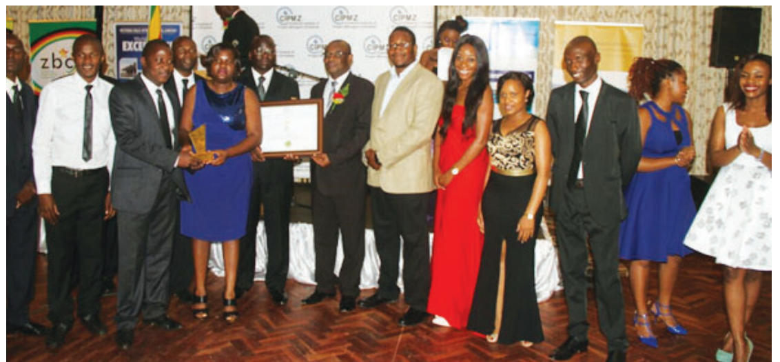
The Exodus & Company team receiving the Property Development Award.

The Chartered Institute of Project Managers' objective is to simplify the every-day work of project managers. So we have developed a certification system that is adapted to your needs and not vice-versa.